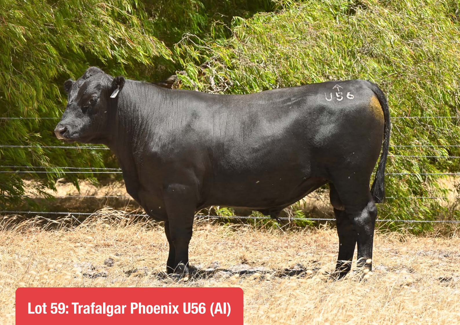
Lot 59: Trafalgar Phoenix U56 (AI)