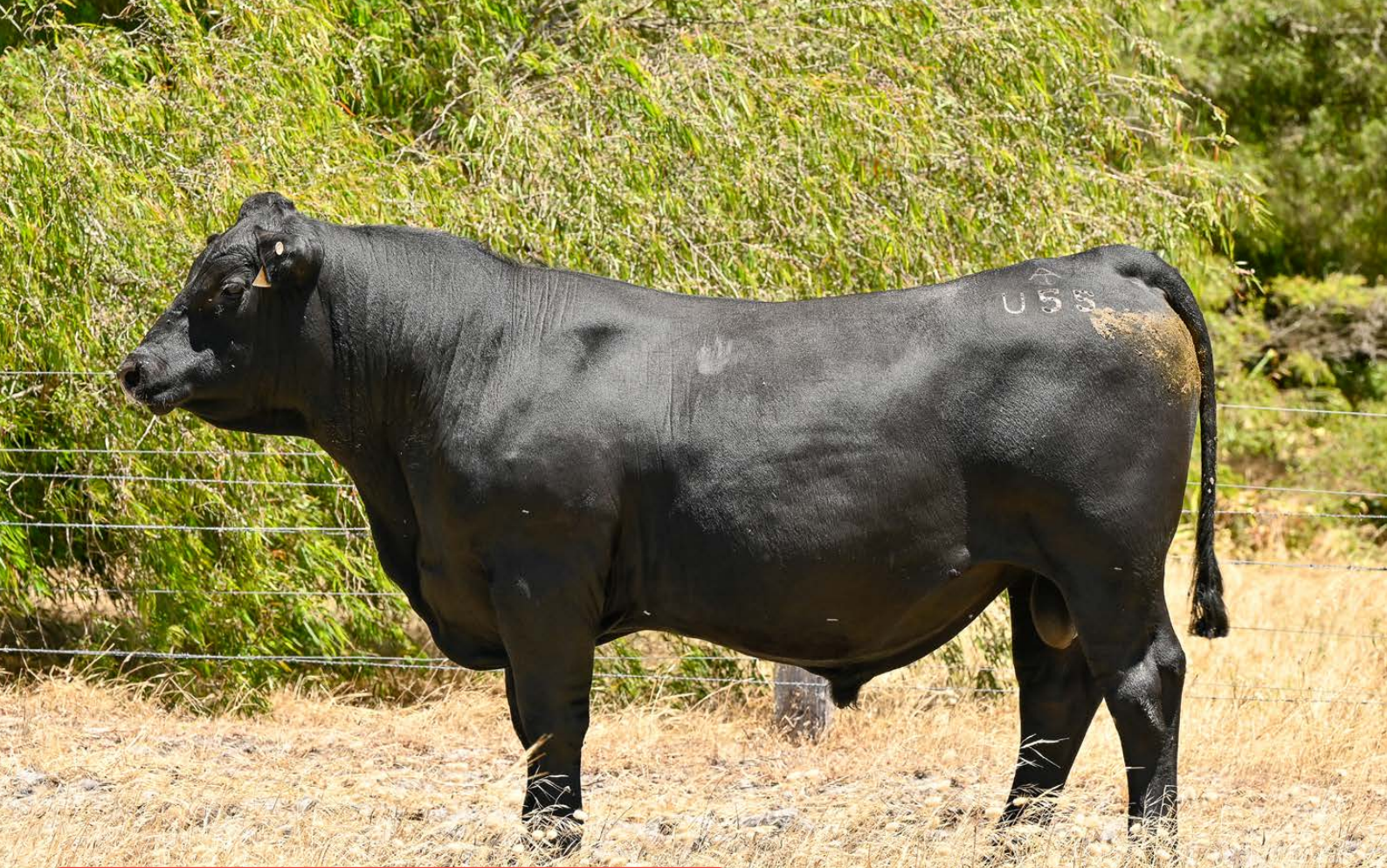
Lot 56: Trafalgar Phoenix U55 (AI)