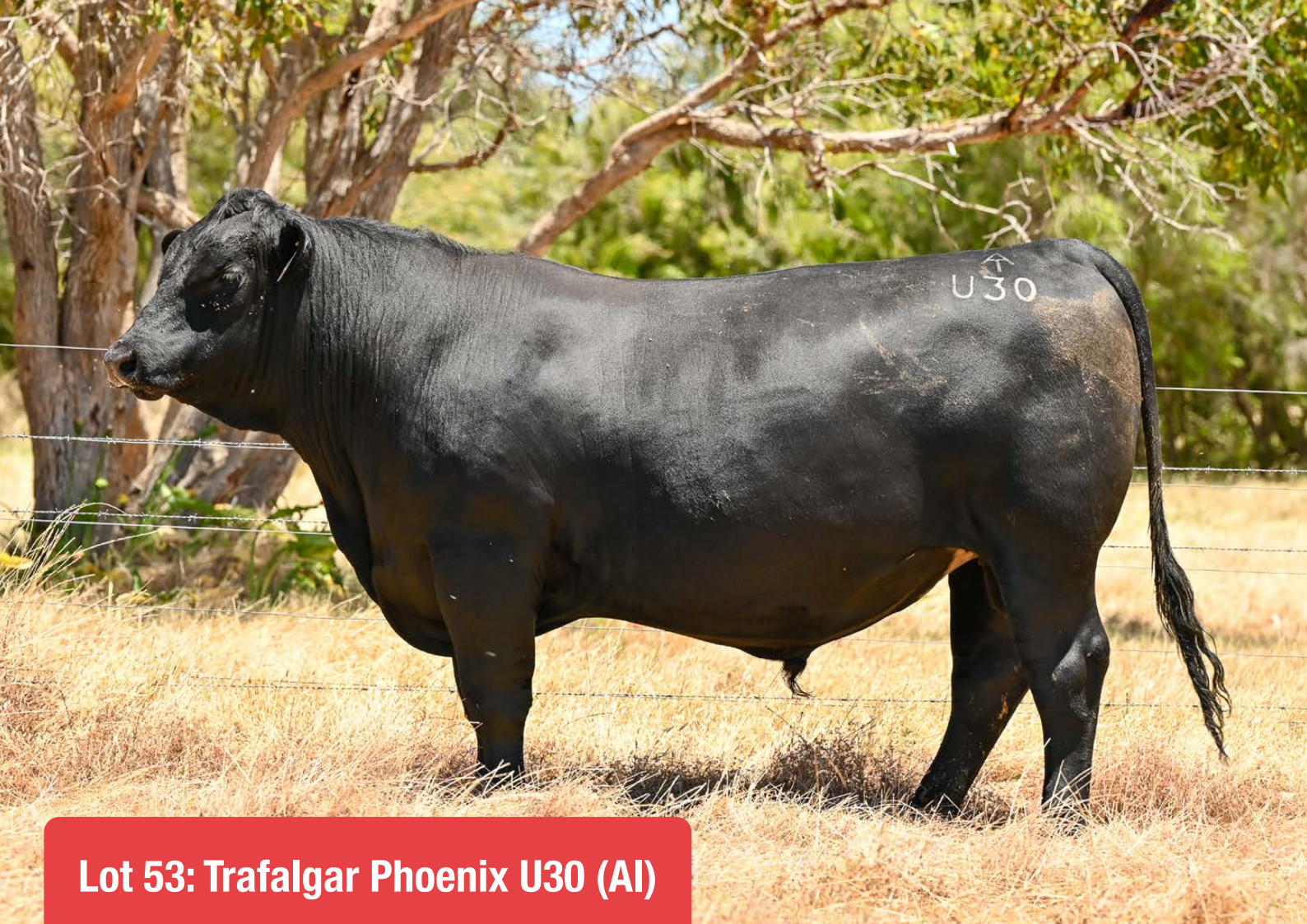
Lot 53: Trafalgar Phoenix U30 (AI)